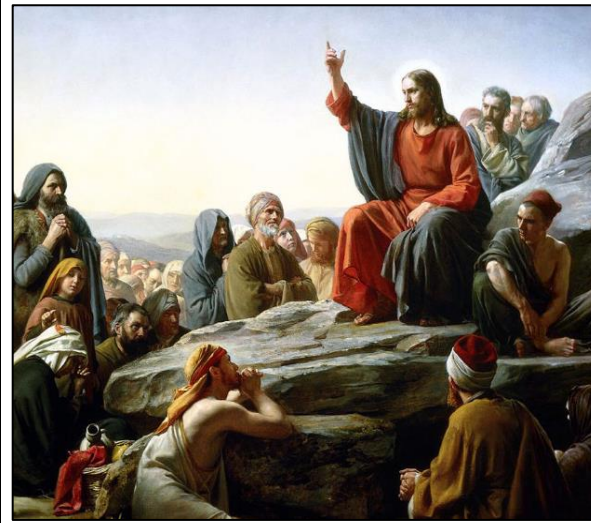
An artist's image of Jesus Christ giving the 'sermon on the mount.'

The holy book in Christianity is called the Bible . A church is a building designed for Christian worship.