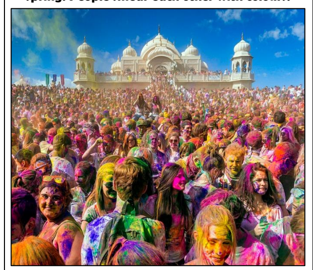
Image of Holi festival, celebrating the start of spring. People smear each other with colours.

Hinduism does not have one holy book, but several sacred texts. Mandirs are Hindu worship buildings.