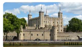
Tower of London